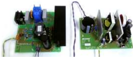
ON Semiconductor PFC (left) and Power Integrations switch mode PS (right).

Below is an image of a 300 W, dual-output SMPS (+12Vdc main output, +5Vdc standby output) that Ecos tested as part of the 'Ac-Dc Power Supplies' report. The SMPS is comprised of an ON Semiconductor PFC front end driving a Power Integrations SMPS back end.